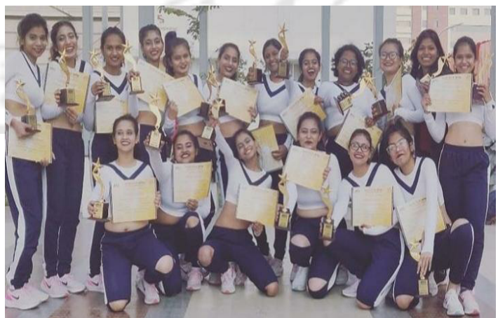
GLIMPSES OF THE PERFORMANCES AND AWARDS-ELEGANZA