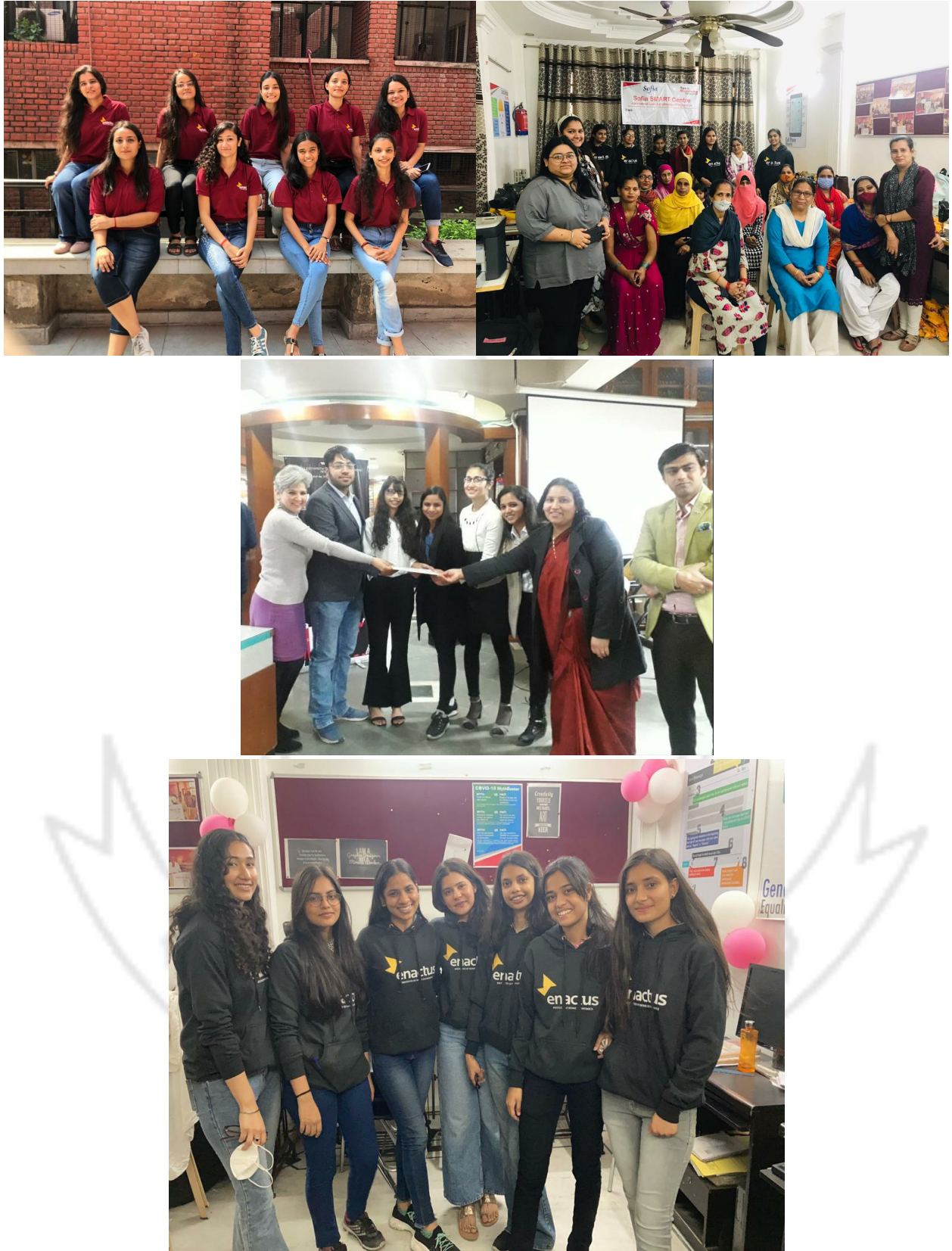
ACTIVITES OF TEAM ENACTUS