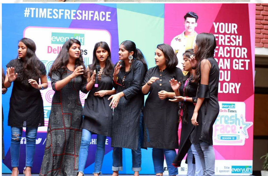
GLIMPSES OF THE ENTHUSIASTIC TEAM AT COLLEGE EVENTS