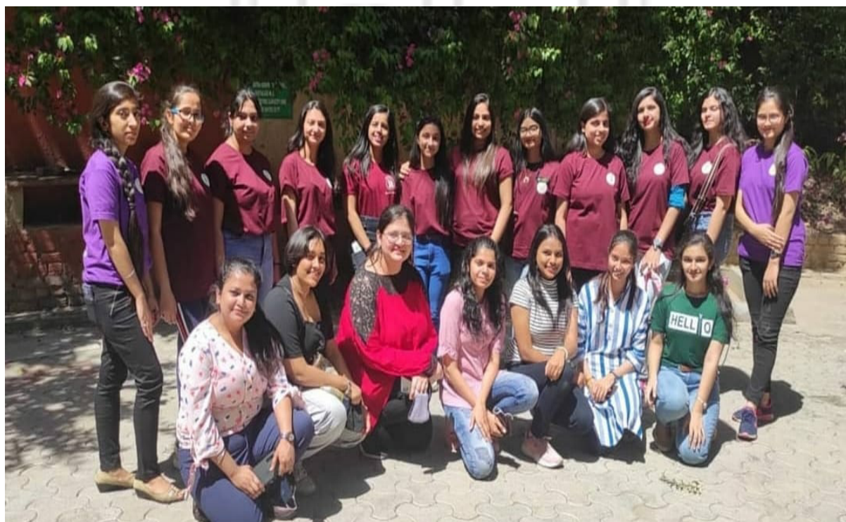
MEMBERS OF IRIDESCENCE

Additionally, this year the Iridescence Instagram page served as a platform where every month, the students get an opportunity to showcase their work based on the different themes.