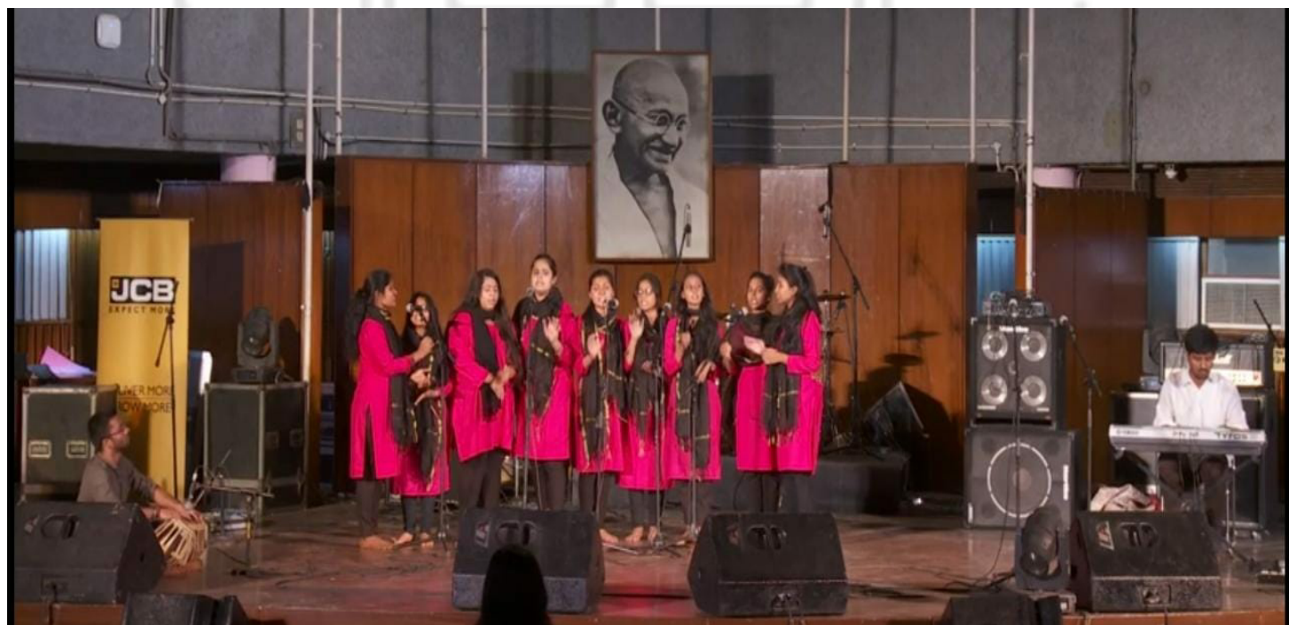
THE TEAM OF TARKAAZ PERFORMING AT A CULTURAL FESTIVAL

The society, Tarkaas participates in all the prestigious competitions, non-competitive gigs and concerts in various institutions. To name a few, Tarkaas participated at AIIMS, IIT Kanpur, IIT Delhi, Ramanujan College, Bhaskaracharya College, Lady Shri Ram College, Kamla Nehru College, Gargi College, PGDAV Evening College, Dyal Singh College, Lady Irwin College, Deshabandhu College, DTU. the members of the society have won accolades and awards at many prestigious college events.