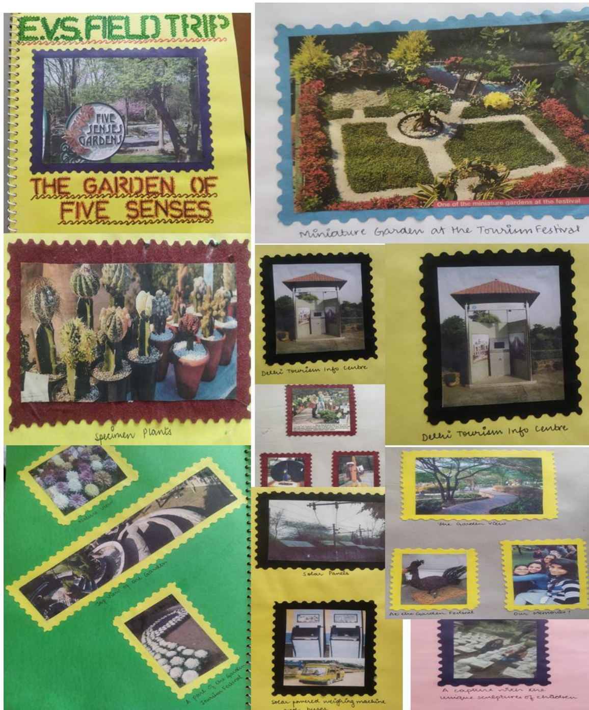
Fig.1. Visit to Garden of Five Senses

An educational trip to garden of five senses was organized for Environmental Science students.