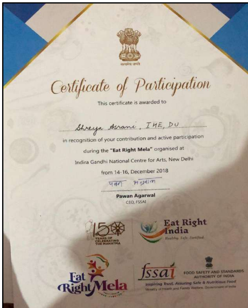
Certificate of Appreciation for students by FSSAI (2018)