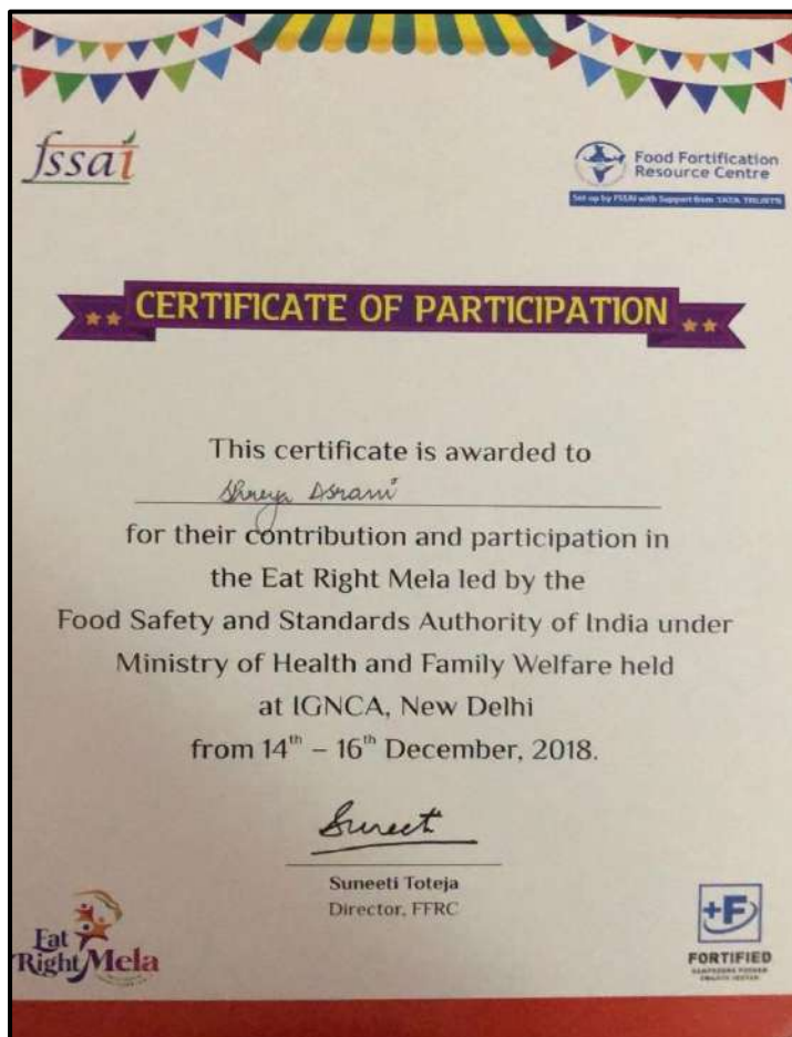
Certificate of Appreciation for students by FSSAI (2018)