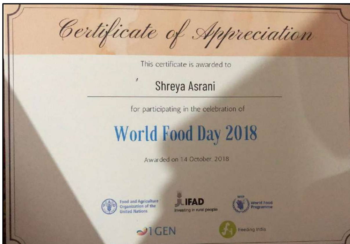
Certificate of Appreciation for students by FAO