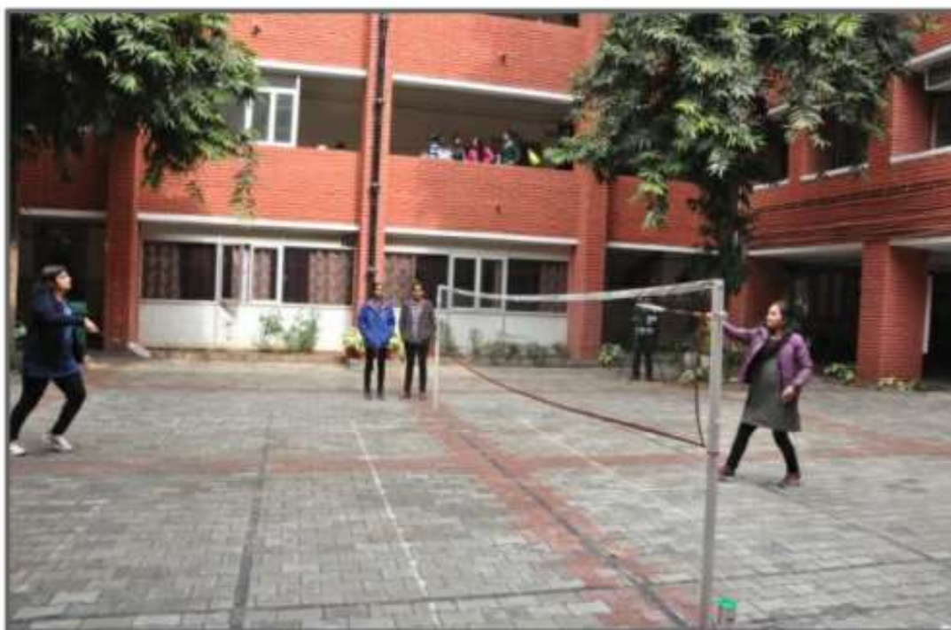
Students at Badminton Court