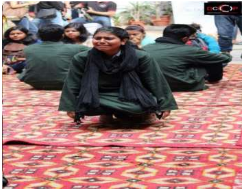
Team Naveang participating in street play FERIA 2017