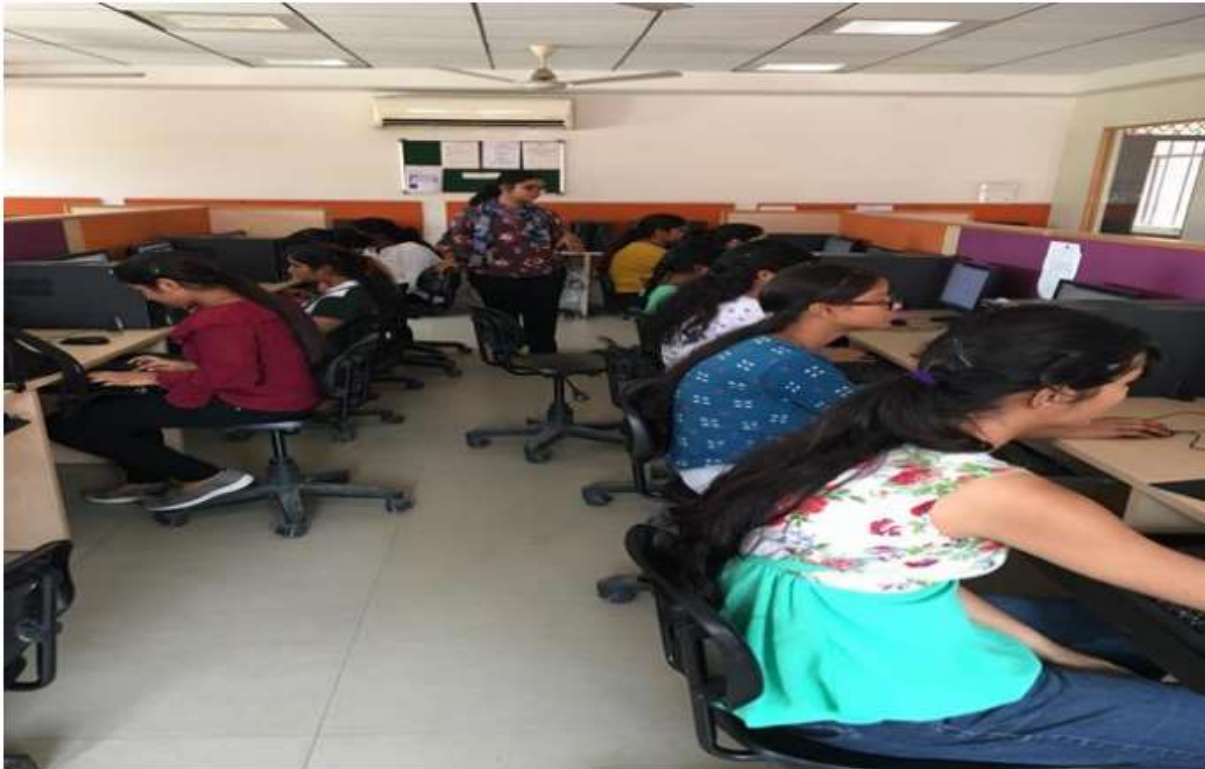
Online quiz competition for students in collaboration with UDGAAR