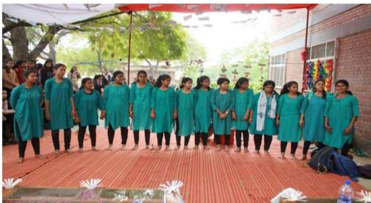
Team Navrang of IHE participating in a event