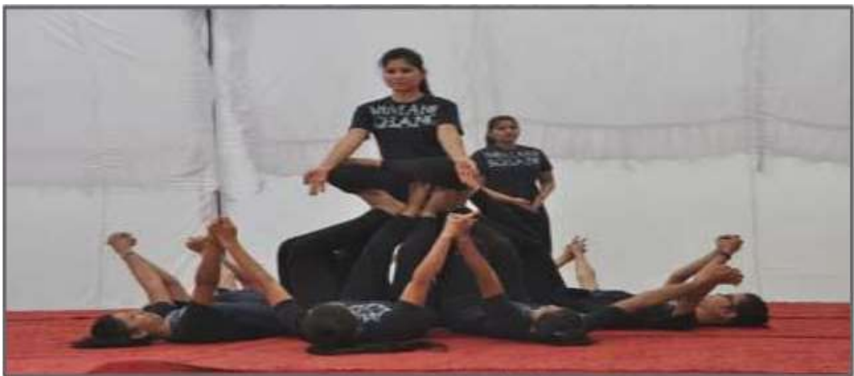
Towards Fitness with Yoga