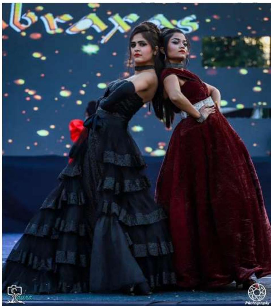
Team POISE of IHE, Participating in a fashion show event