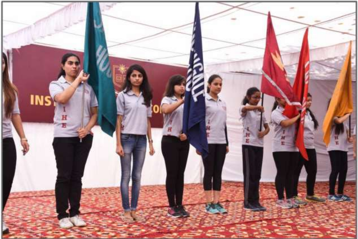
Inter-House Oath Ceremony