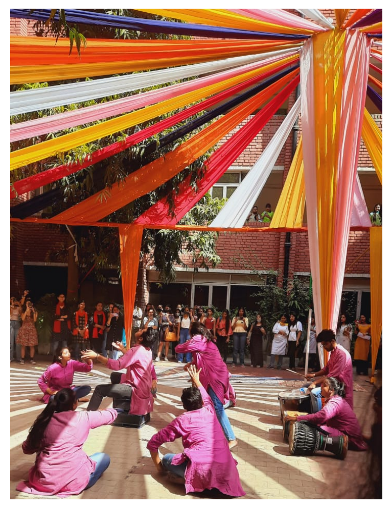
Goonj- the Street Play Competition