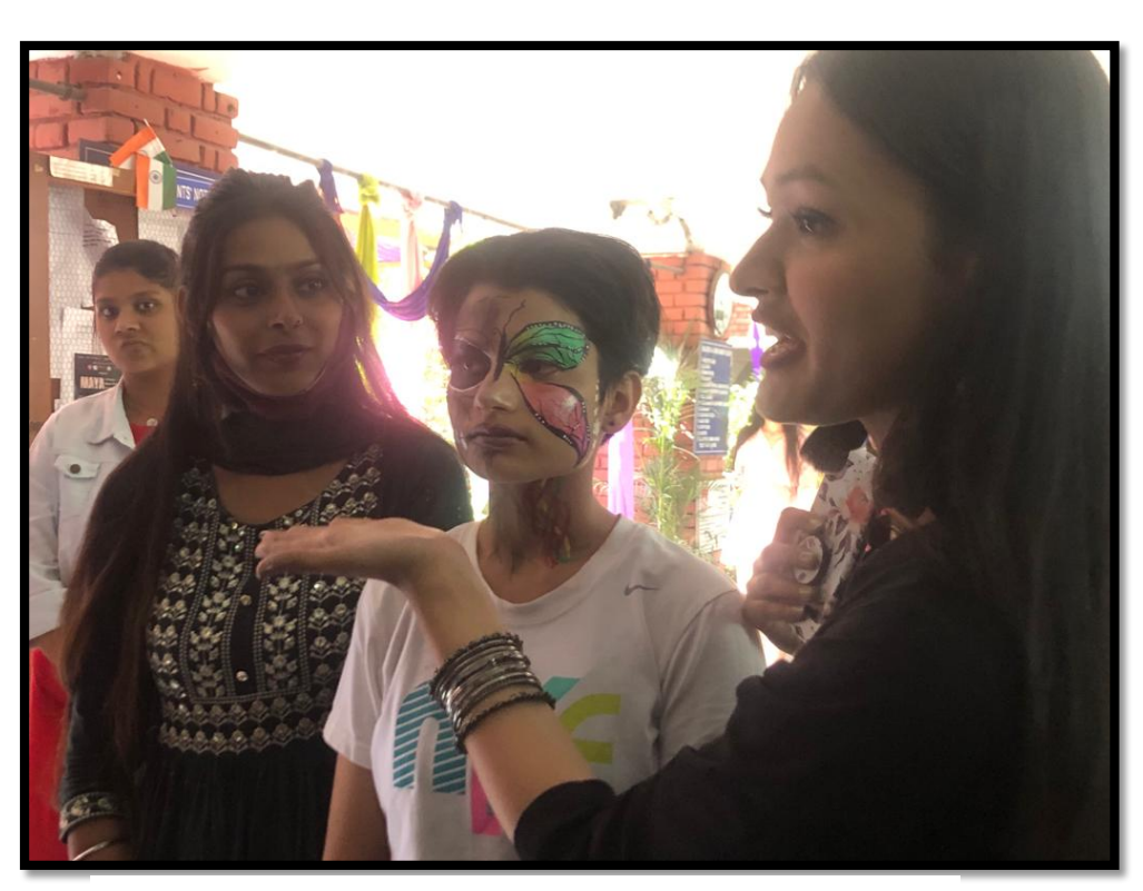
Face Painting Competition