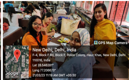
Teacher/ Student Participation in Madhubani Workshop