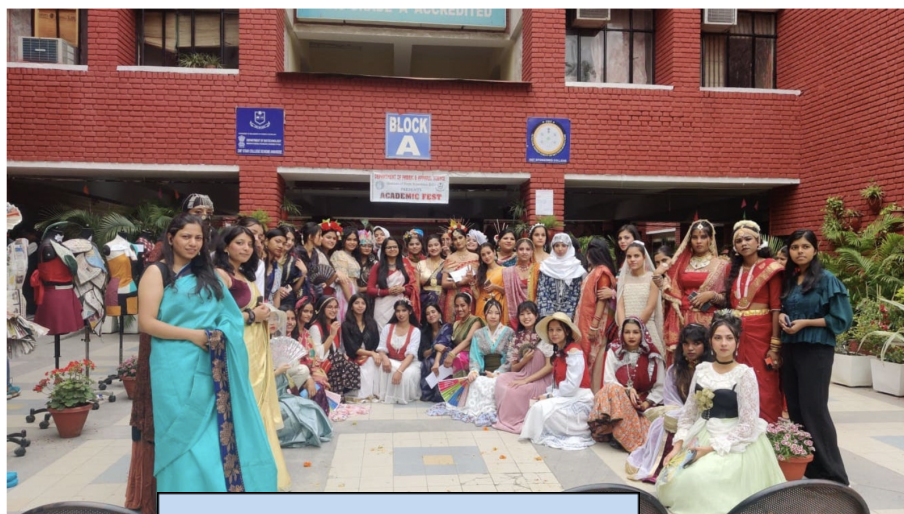
Participants of the Fashion Show

"Regime of Cultural Couture - G20" was not just a fashion show; it was a celebration of diversity, creativity, and cultural heritage. The event successfully united G20 nations through the universal language of fashion, highlighting the importance of preserving and evolving cultural traditions in the world of couture.