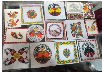
Madhubani Artwork - Student's Work