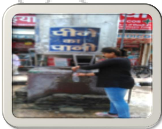
Microbiological analysis of drinking water in Hauz Khas

The college is gratified to state that as part of Star College Scheme by Department of Biotechnology, during the period 2017-2020, more than 40 minor projects were undertaken by undergraduate students, many of which were interdisciplinary in nature. Some of the research projects were on themes such as microbial quality of water, indoor and outdoor aeromycoflora of metro station, life style changes associated with PCOD, adulteration in spices, natural of mordants & dyes in textiles, new generation textile fabrics, implementation of food safety requirements in college cafeteria, air pollution tolerance index of different plant species. The participation of under-graduate students in research helped them in learning about various stages in research including review of literature, developing research protocols, research tools, data collection, resolving functional & technical issues in carrying out experimental research and data analytics. This also provided myriad opportunities to students to present their work at different platforms. Several students from the college won prizes in research presentations motivating them to undertake research as a career.