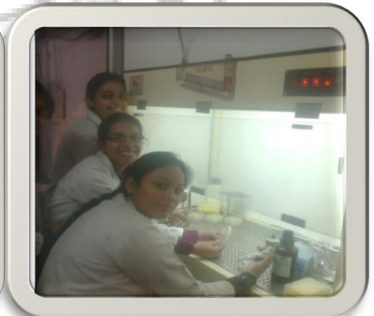
Analysis of effect of pH and temperature on Anthocyanin pigment of Jamun