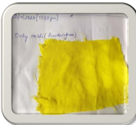
Use of curcumin as a direct dye and its application on home-made mask