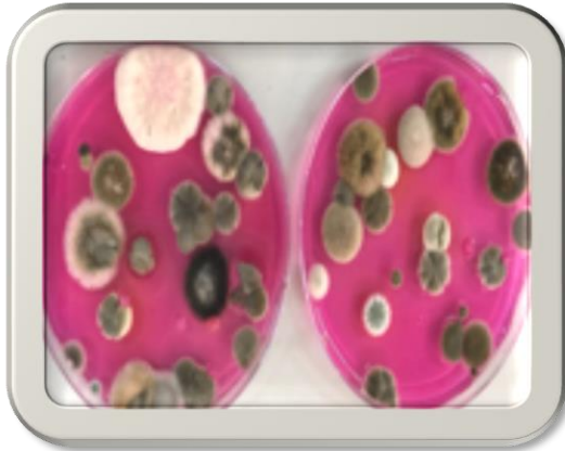
Distribution of aero-fungal spores at metro station