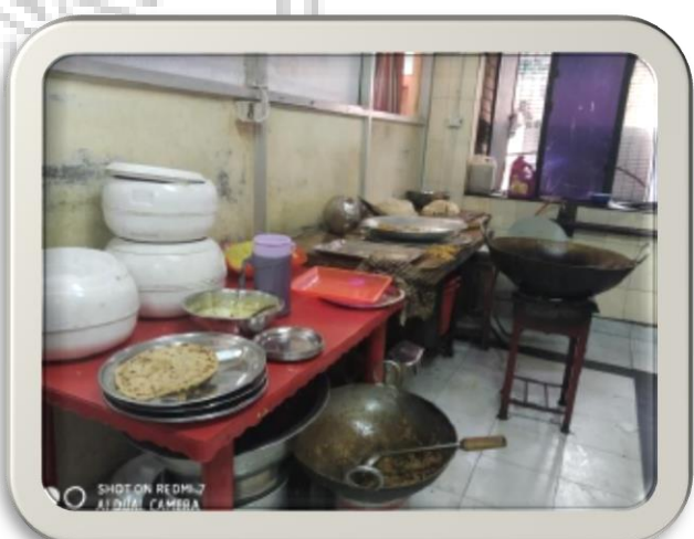
Implementation of food safety, health and sustainability requirements as per FSSAI's Eat Right Campus in IHE Cafeteria